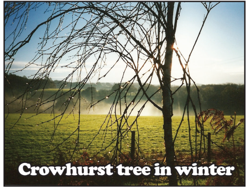
Crowhurst tree in winter

During this winter season, could a leafless tree 'speak' to you as it did to Brother Lawrence? Ask the Lord to guide you.